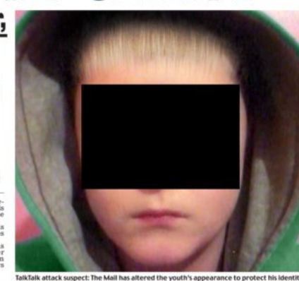
TalkTalk attack suspect: The Mail has altered the youth's appearance to protect his identity

boy was arrested in the pebble-dashed property he shares with his single mother on a rundown estate in Northern Ireland. His online blog reveals he is obsessed with violent video games such as Grand Theft Auto. And neighbours say he was being taught at home after repeated suspensions saw him kicked out of school. He's always